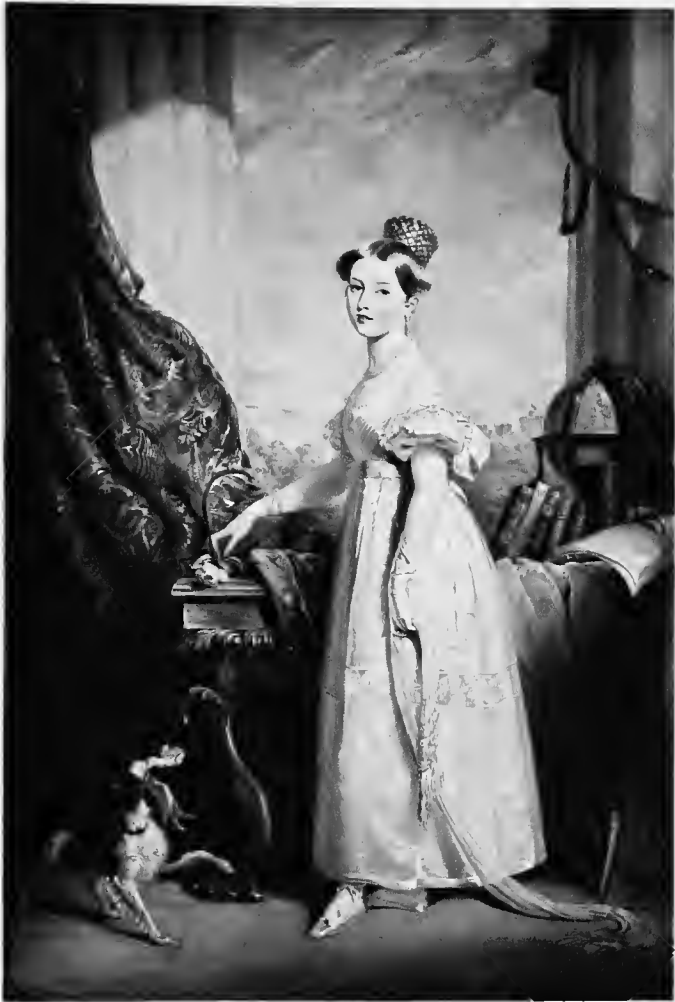
H. R. H. Princess Victoria 1833

From the picture after Sir G. Hayter at Windsor Castle